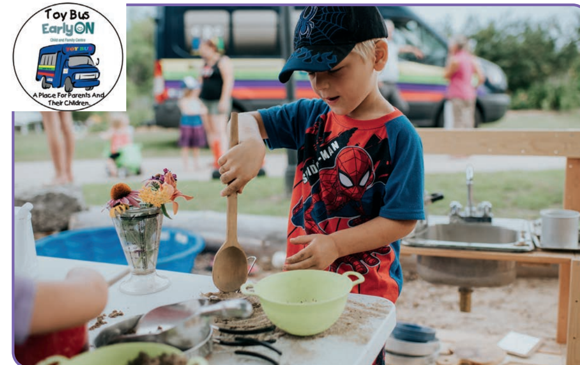
The EarlyON Toy Bus will be at Station Park on Tuesday mornings from 10:00 until 11:30. Come out and play with us!