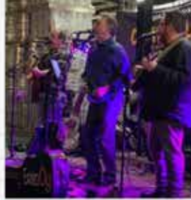
BOSTON ERIN OG AUG 20 - 7PM