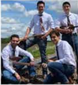
THE COUNTRY LADS AUG 19 - 7PM