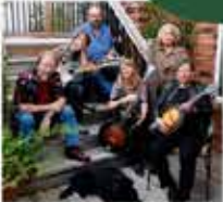
KINDERED 7 AUG 20 - 2:30 PM