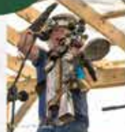
WASHBOARD HANK AUG 20 - 4:30 PM