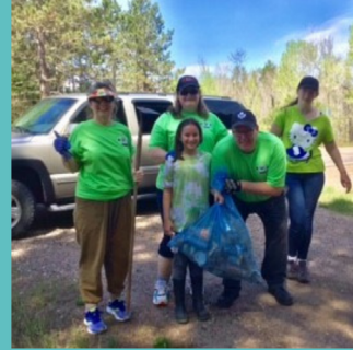
Gathering Over Garbage - Social Debris '23 getting the whole family involved!