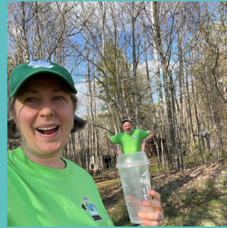
Don't Ditch The Ice Cap - Bin There Dump That Cap-turing a winning pic on the road!