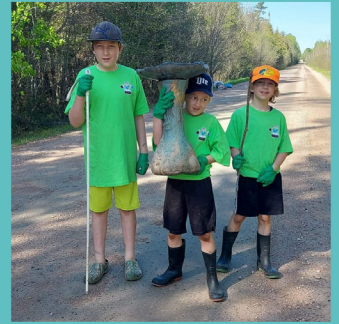
Sundial You Better Take Care - Trash Pandas rocking their old time find.