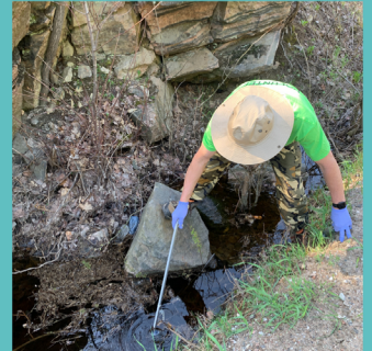
Water Warriors- The Tramore Trashers leaving no trash behind!