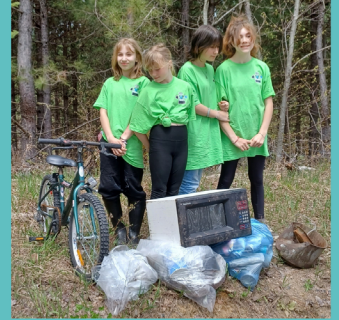
Moving Mountains - the Garbage Gobblers on Mountain View Road making a difference!