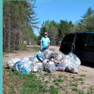
Piling Up: Retirees of Red Rock Road well on their way to their 43 bag total haul.

2023 was one for the record books! With a record breaking 95 participants (plus 300 students), on a record 28 teams picking a record 200 bags of garbage/recycling in addition to truck loads of scrap metal, demolition material and dozens of appliances from our road ways. Volunteers should certainly be proud of what they accomplished and the Municipality of Killaloe Hagarty and Richards would like to give our deepest gratitude to everyone who pitched in and helped clean up the environment! This year we certainly found much of the same things such as discarded appliances and recyclables that could have went to the waste recovery site for free. We also saw many strange things such as bikes, boom boxes, sinks, tires and even a sundial in the swamp. To some this could be considered discouraging. However, in 2023 we actually have many things to celebrate. Record youth involvement, record participation, record attendance at our pre-event gathering, the power of community cleaning up 200 bags from the environment, the honks, the waves and the stops to thank volunteers and now roads needing less attention in 2024 due to less garbage. Thanks to you, We are making a difference!